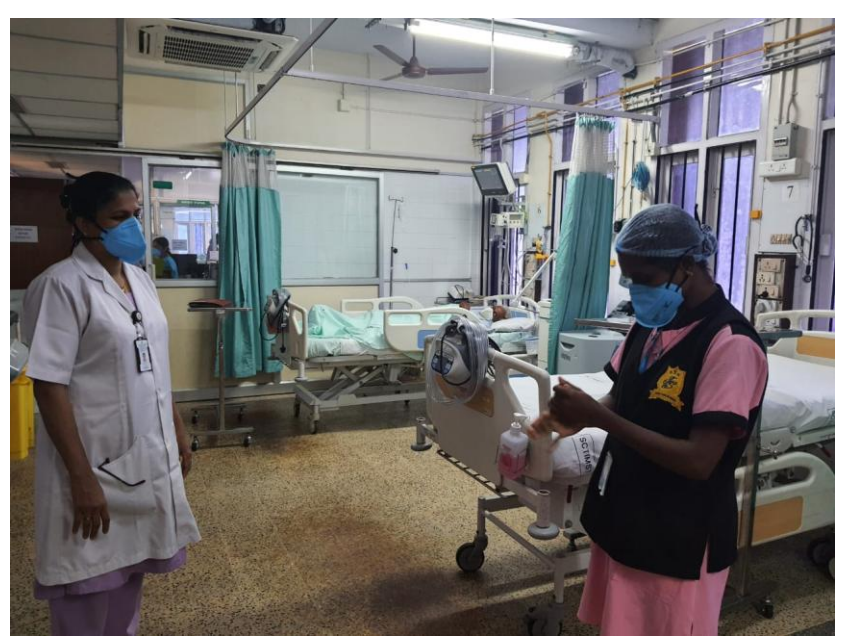
Hand hygiene audit for various categories of HCW