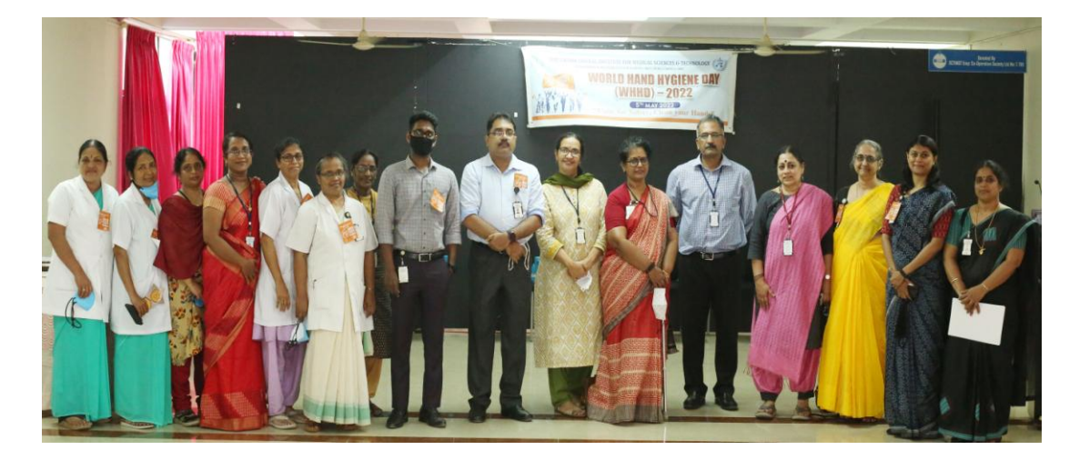
Closing session of the event