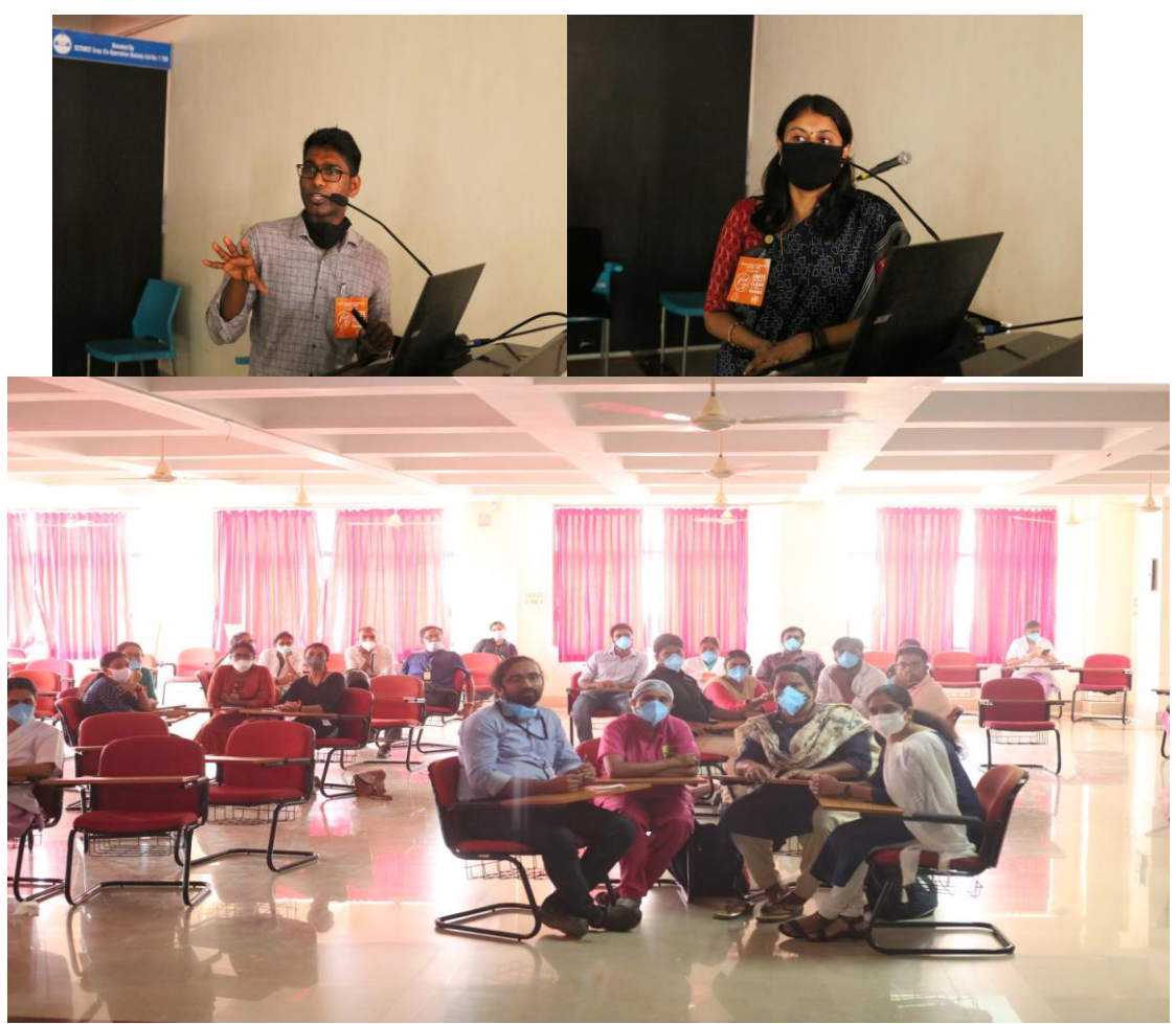
Quiz competition conducted on "Infection Prevention and Control" for teams from various clinical departments